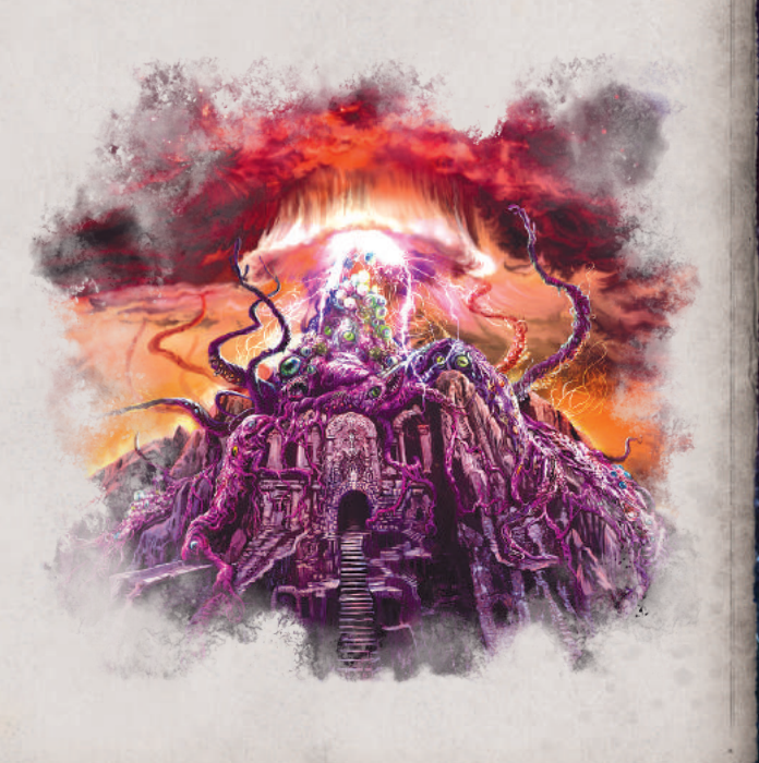
( Do not read the campaign epilogue, even if you win the scenario.