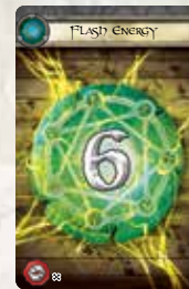
FLASH ENERGY CARD

Players can use a "Flash Energy" card to boost spells. When a player casts a spell, he may discard one flash energy card to fuel the spell.