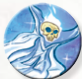
CLOAK OF SHADOWS