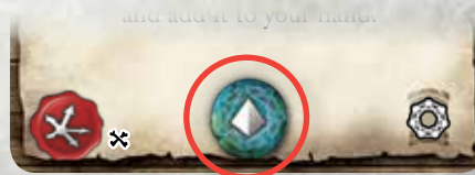
RANDOM ENERGY ICON

When a player uses a Magic card that has the random energy icon at its bottom edge, he rolls one die. Its result is the amount of energy provided by that Magic card.