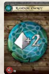
RANDOM ENERGY CARD

When a player uses a "Random Energy" card, he rolls one die and adds its result to the value shown on the card. This sum is the total amount of energy provided by the card. The player can use this energy to boost his wizard's speed or boost a spell.